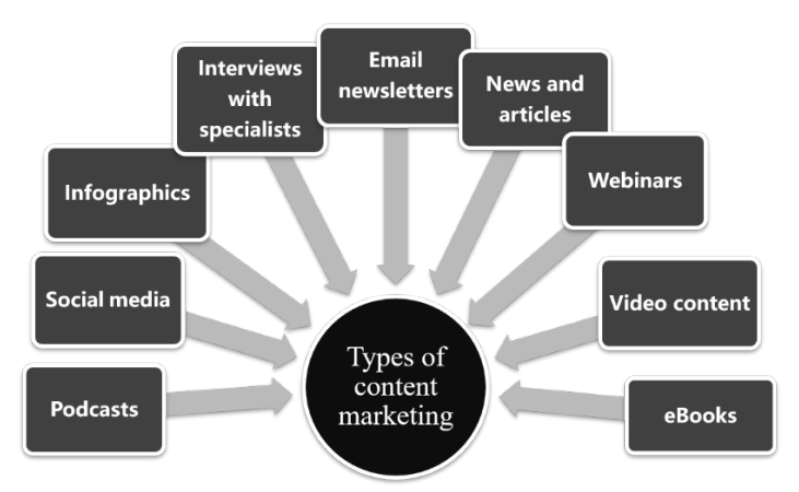
Figure 1 – Content marketing forms

Content marketing is a strategic marketing and business process aimed at creating and disseminating valuable, relevant, and consistent content to attract and retain a clearly-defined audience and, in the end, stimulating the profitable activity of the customer [1]. The population's need for quality, valuable and exciting information is used in various spheres of activity, including promoting medical services. An essential difference between content marketing and other digital marketing tools is the absence of direct advertising. The unique feed of the material can produce a "viral" effect, which brings the potential client closer to the expected decision-making – uses the service of a particular clinic or company. For spreading content, clinics most often use social networks, news, and medical portals, own sites. Figure 1 presents the most common forms of content marketing that, when applied comprehensively, can ensure maximum availability (comprehension) of the material shown.